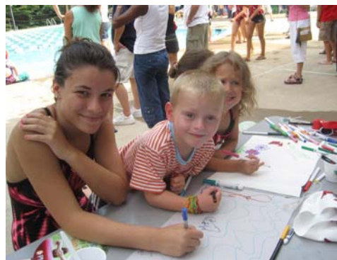
Aspiring artists of all ages were on hand at poolside this summer for the Minis.